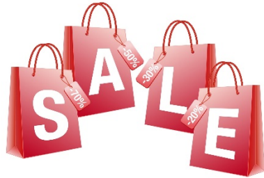
Clothes & Toiletries